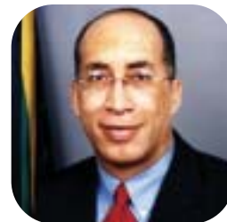
Hon. Delano Franklyn Minister of State Minister of Foreign Affairs & Foreign Trade

I am confident that the contribution from you, the dynamic and action-oriented Jamaican community in the United States, will play a significant role in the success of the Conference. I look forward with pleasure to welcoming those among you who will attend the Conference.