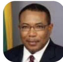
Hon. Anthony Hylton Minister of Foreign Affairs & Foreign Trade

I rest secure in the knowledge that the opportunity for continued dialogue among the stakeholders provided by the Conference will be used to our best advantage.